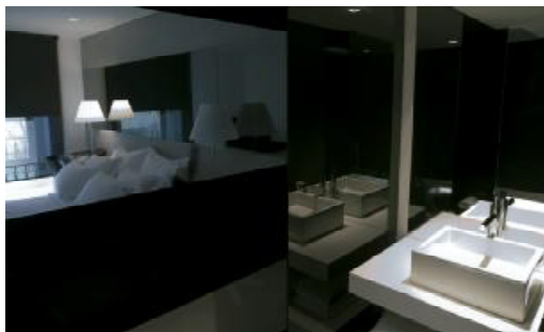
Fontana Park Hotel, Lisbon, Portugal