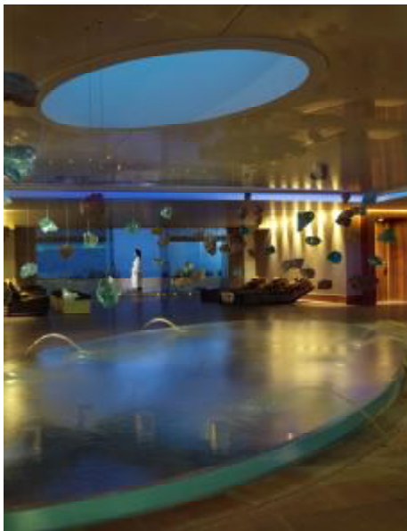
Six Senses Spa @ Porto Elounda Deluxe Resort, Crete, Greece