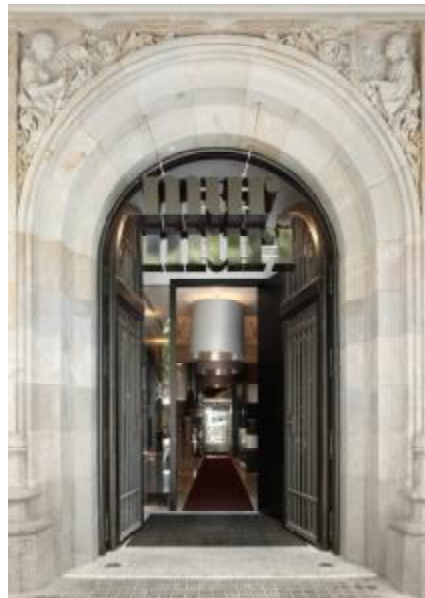
Murmuri, Barcelona, Spain (GCA Arquitectes)