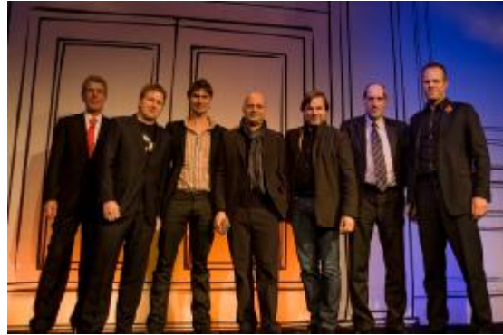
Citizen M, Amsterdam, The Netherlands