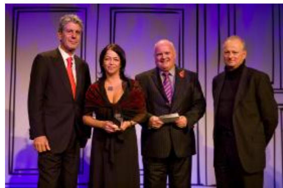
Radius B+S Kft