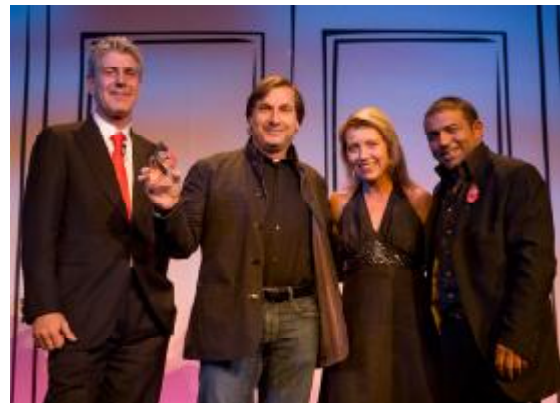
Citizen M, Amsterdam, The Netherlands