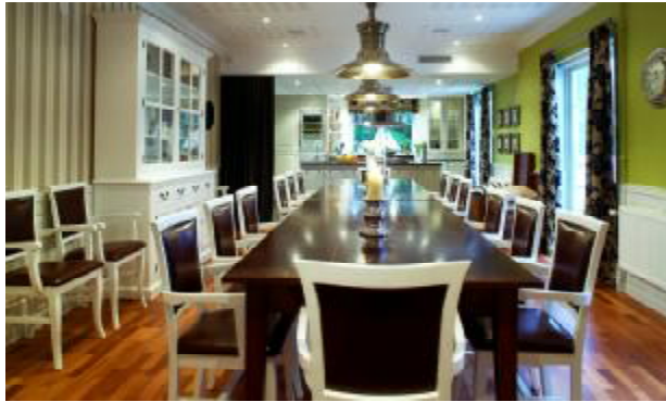
Villa JC Stevens , Stenungsund, Sweden