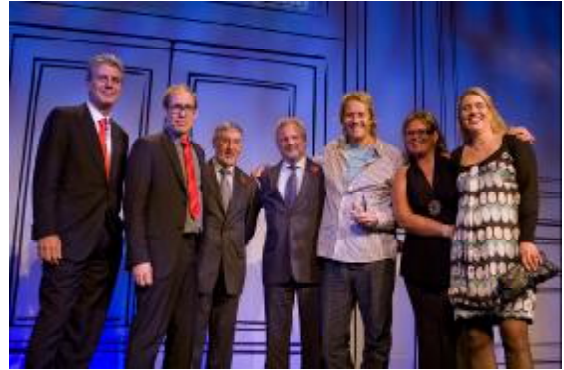
stylt Trampoli AB