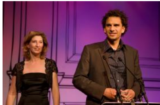
Foster + Partners