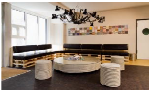
Superbude, Hamburg, Germany