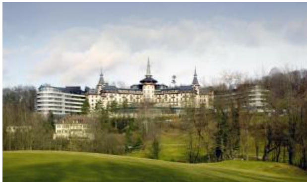
The Dolder Grand Hotel, Zurich, Switzerland