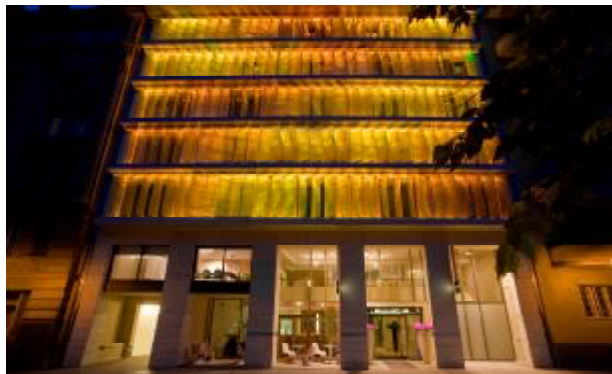
Lanchid 19, Budapest, Hungary