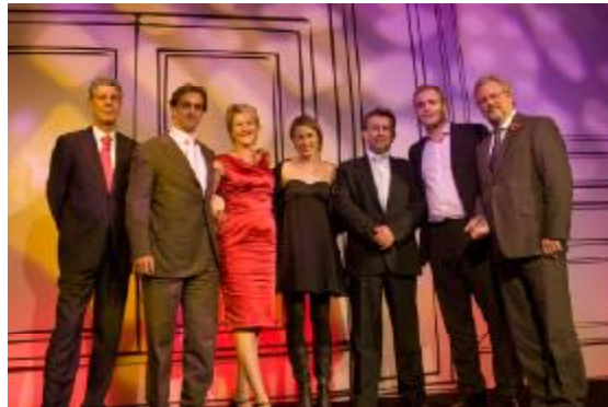
The Syntax Group