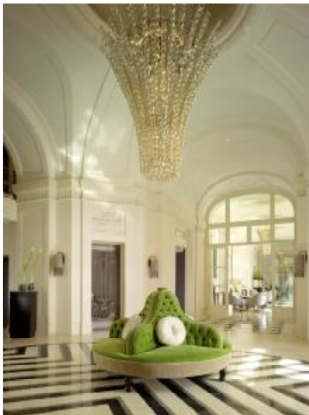
Trianon Palace & Spa, A Westin Hotel, Versailles, France