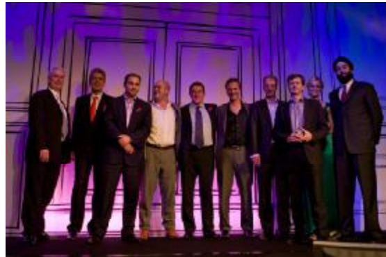
Travelodge Euston Sq, London, UK