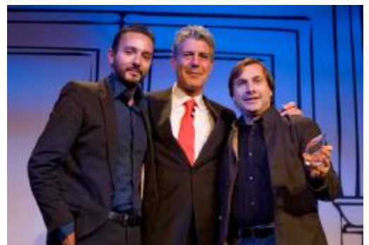
Citizen M, Amsterdam, The Netherlands