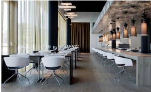
Carbon, Genk, Belgium