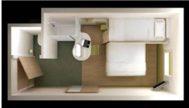
ETAP, Paris, France